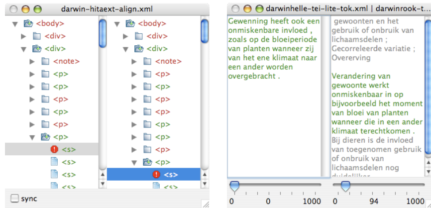
Figure 2: Screen shot of Hitaext, the tool used for aligning text segments

One of the distinguishing features of Hitaext in comparison with other text alignment tools is its support for simultaneous alignment at multiple annotation levels (e.g., words, sentences, paragraphs, and chapters). Another feature is the lack of a predefined input format for the source and target documents; the only constraint is that the XML must be well-formed. In fact, this makes Hitaext a general graphical tool for aligning text elements in pairs of arbitrary XML documents. It might therefore as well be used for tasks like aligning bilingual text at the word level or aligning ontological hierarchies. Other features include automatic synchronization of the two trees, i.e. focus automatically jumping to the (first) aligned element in the other tree, and quickly walking through all aligned elements in the case of one-to-many or many-to-many alignment.